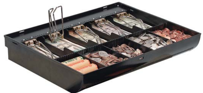
Metal Bill Weights