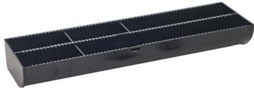
Removable Coin Tray Euro and US configurations