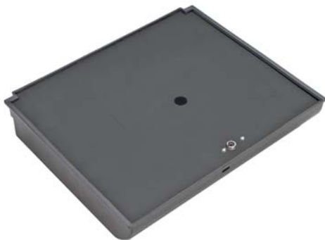
Steel Locking Till Cover P/N 226 199TILCVR04