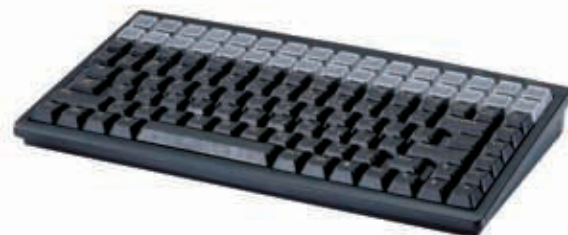
MCI 128 with Alpha layout