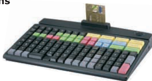
MCI 128 with Smart Card Reader, Keylock, MSR and customized key set